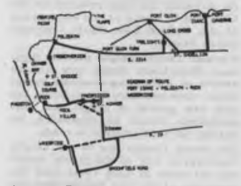
Coach to Truro: Thursday 30th. June, leaving the garage at 9.30am. To Truro via Polzeath and Rock (Clock Garage).

Mark Prout's new bus timetables have a map of the route on them which is reproduced below. It is a beautiful ride and a pleasant way to Wadebridge with no parking problems at the other end. From the bus you can see right over the tops of the hedges and get views of the countryside that you would never dream existed when you are in a car. It means you have to use a whole morning to visit Wadebridge - there is a bus at 9.30am. from Port Isaac, and the midday one back leaves Wadebridge at 14.05 gotting back here at 14.66 - but why not have a morning off and perhaps have coffee in town at the same time? Did you know that you can see the church of St. Enodoc from the road?